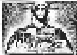
A photograph of a woman, possibly a news anchor, looking directly at the camera.

The station's actions have been questioned, and it is believed that the news coverage was not as accurate as it should have been.