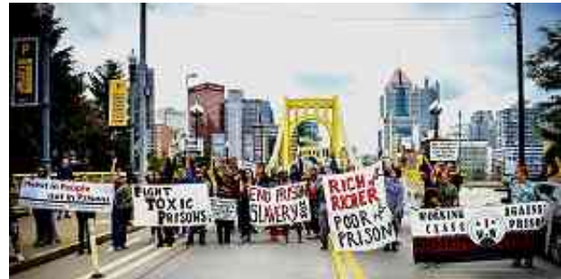
The 2019 Fight Toxic Prisons Convergence is June 14–17 in Gainesville, Florida and will include speakers, panels, workshops, protests and cultural activities exploring the intersections of anti-prison and environmental struggles. fighttoxicprisons.wordpress.com Above: Protest march following the 2018 FTP convergence in Pittsburgh.

They sell online for $5 a 6-pack with the profits going to cover production and sustain BRABC in its letter writing and flyering costs. Buttons are inexpensive to make and share, plus they're wearable so it encourages telling others about a case.